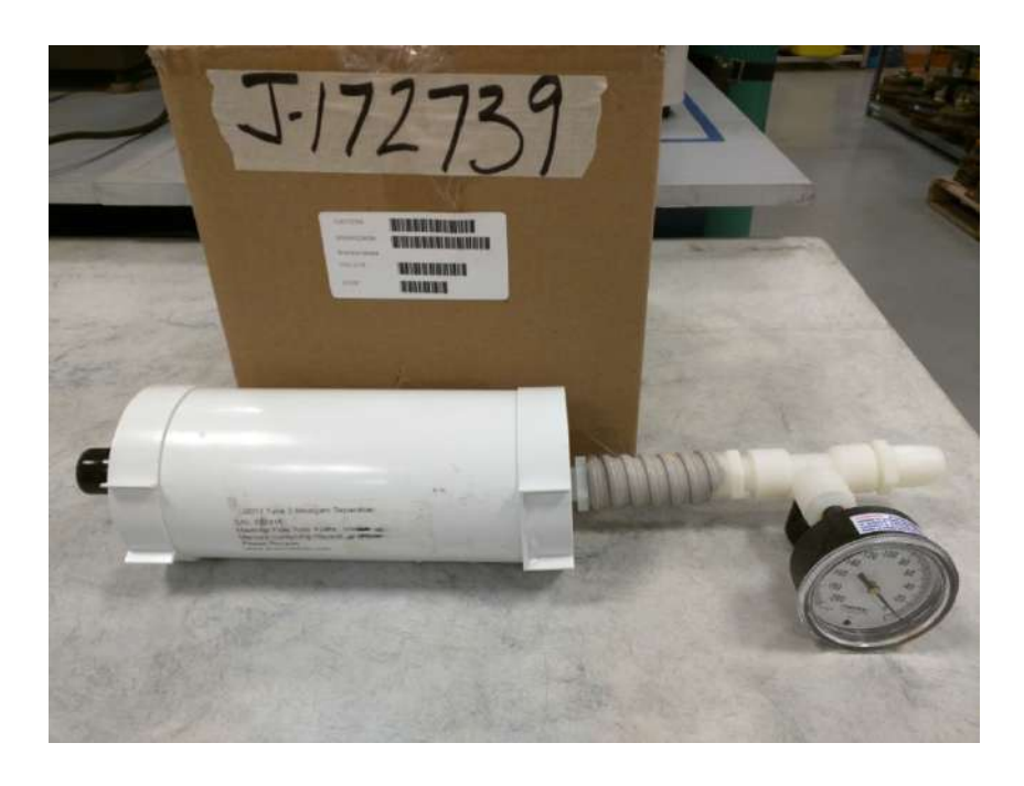
Figure 1 – DD2011 Amalgam Separator